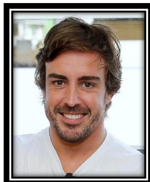
Ferdinand Alonso in 2016

Finish your work by adding some pictures or illustrations. You can copy and paste these from the internet or you can draw your own. Don't forget to write a caption for each picture - a sort sentence to explain what the picture shows.