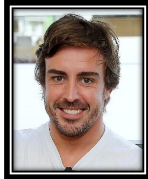
Ferdinand Alonso in 2016

Finish your work by adding some pictures or illustrations. You can copy and paste these from the internet or you can draw your own. Don't forget to write a caption for each picture - a sort sentence to explain what the picture shows.