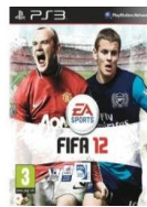
Play Station games £39.99