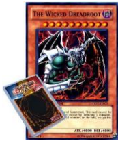
Yugioh card set from £3.00