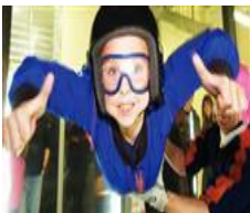
Red letter days indoor skydiving £50