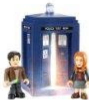
Dr who Lego from £5