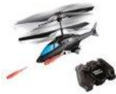
Remote control toys £50