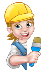
Painter and Decorator