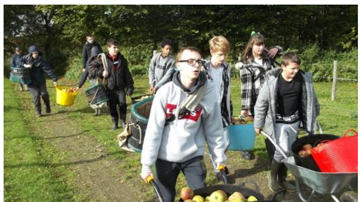
Picking apples at White Rocks