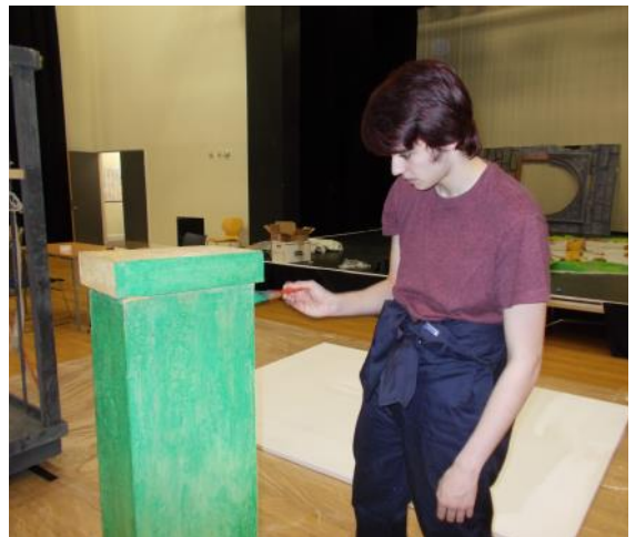
Painting Props, GP @ MKC Medway