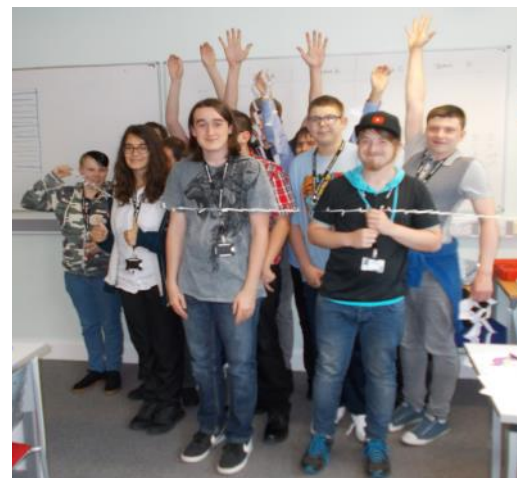
KS5 @ MKC Gillingham