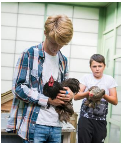
Looking after the animals at KS5 Wrotham