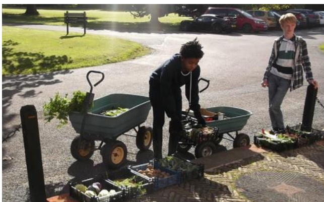
Selling vegetables at Communigrow

I like feeding the pigs on Wednesday mornings at White Rocks because they are always happy to see us and it's fun. KL