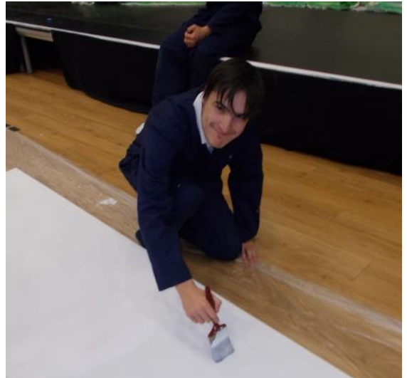
Painting Props, GP @ MKC Medway