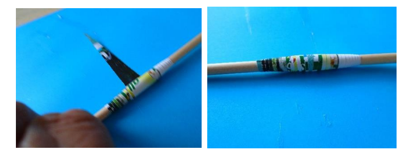
Gently pull the bead off the rod

Make sure that you have glue on the last bit or it will not stick.