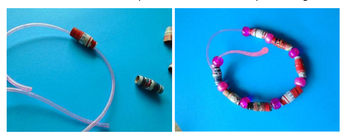
Step 5 Tie a knot to join the two ends. Check it fits around your wrist.

Place your beads onto your length of thread. You could add other beads too. This is where you can be creative in your design.