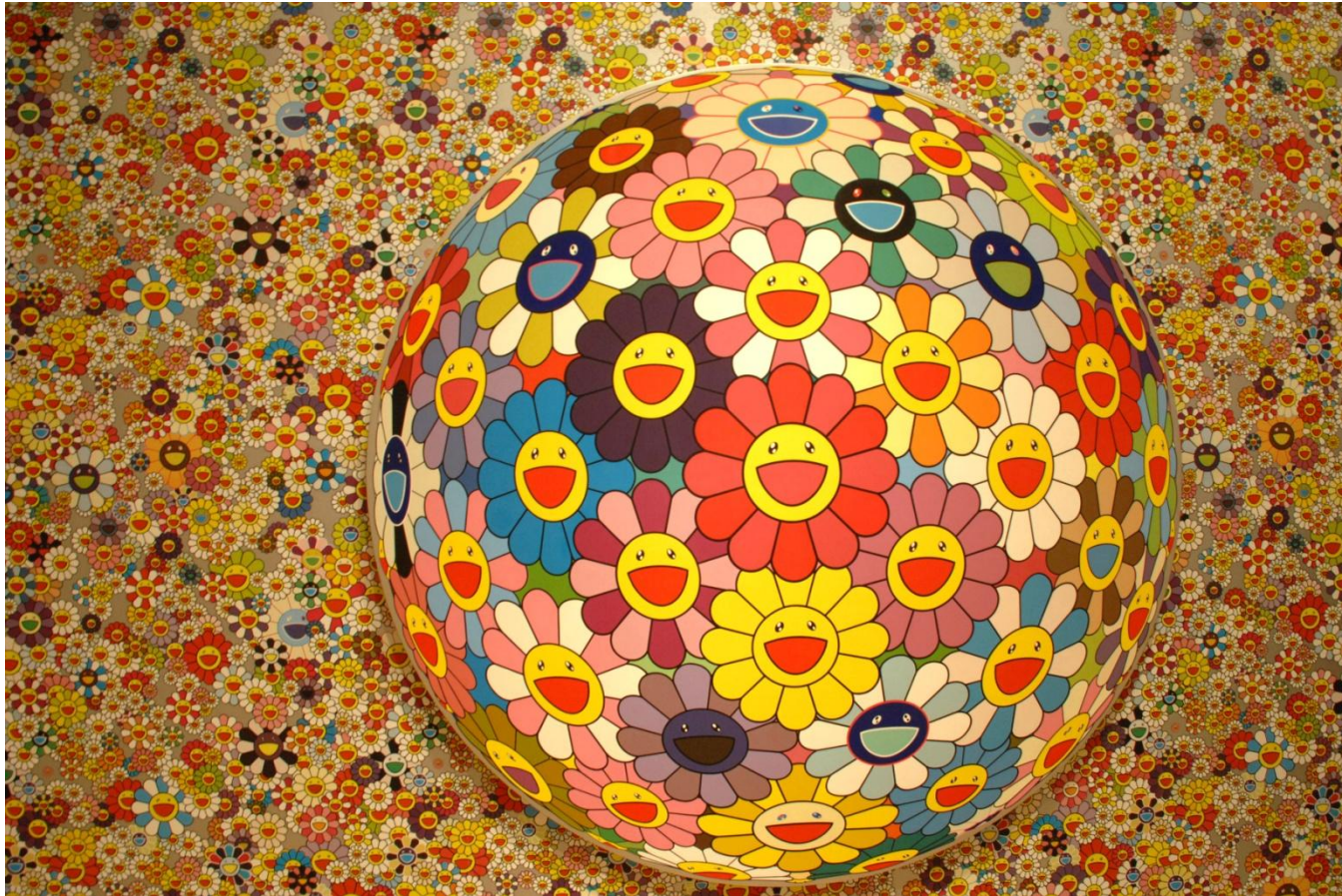
Takashi Murakami, at the 2008 Brooklyn Ball Celebrating © MURAKAMI Exhibition at The Brooklyn Museum on April 3, 2008, in New York City.

Pop Art continues to influence artists around the world today such as Japanese artist Takashi Murakami.