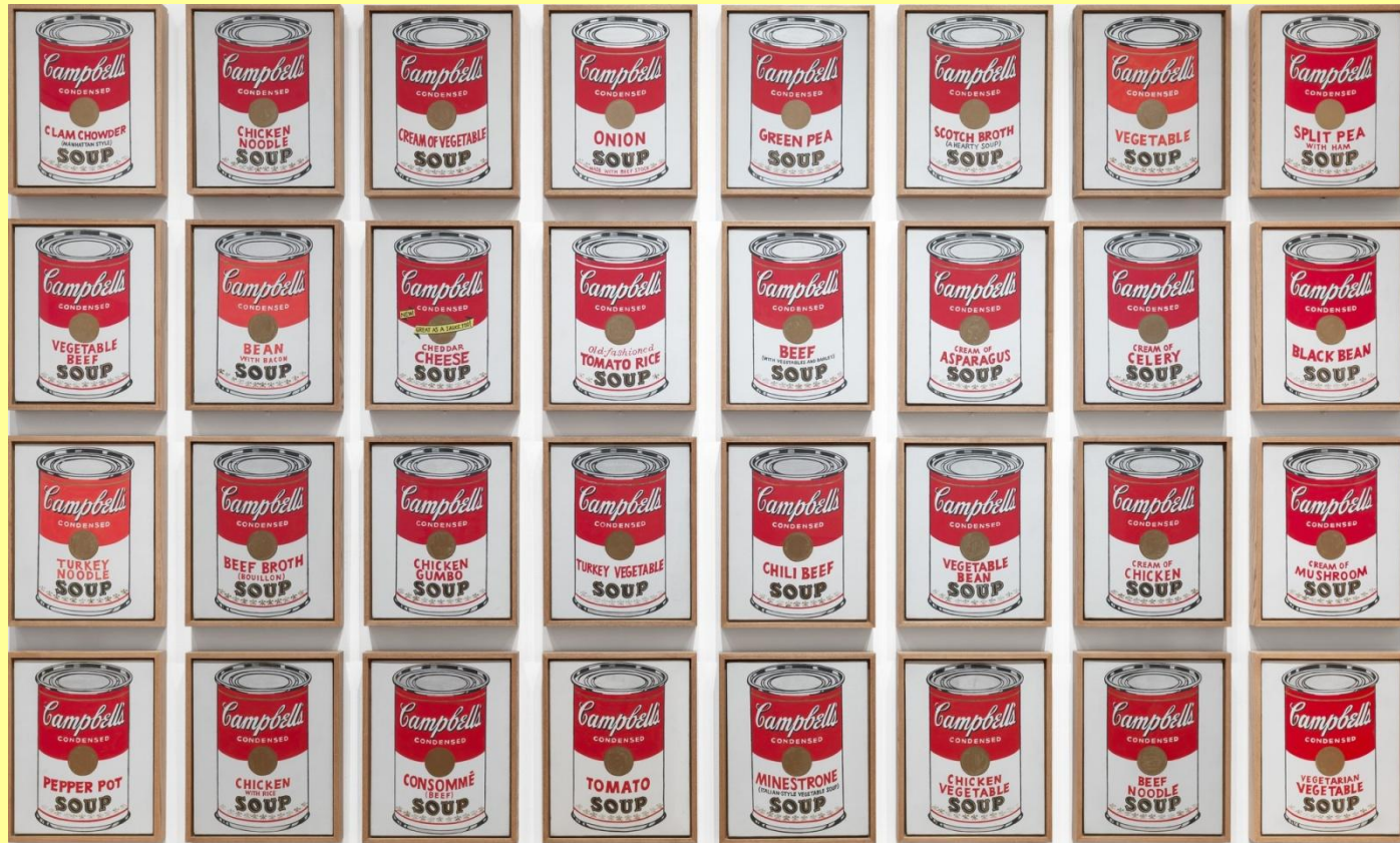
Andy Warhol Campbell's Soup Cans 1962

One of his most iconic pieces of art was a print of Campbell's Soup cans