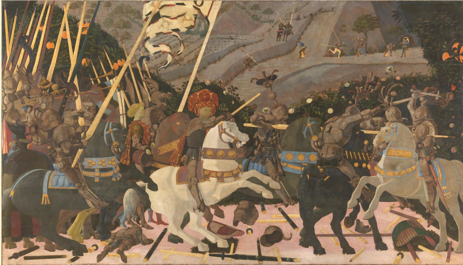
Paolo Uccello, Niccolò Mauruzi da Tolentino at the Battle of San Romano , c. 1438-40, Rm 59 The National Gallery, London