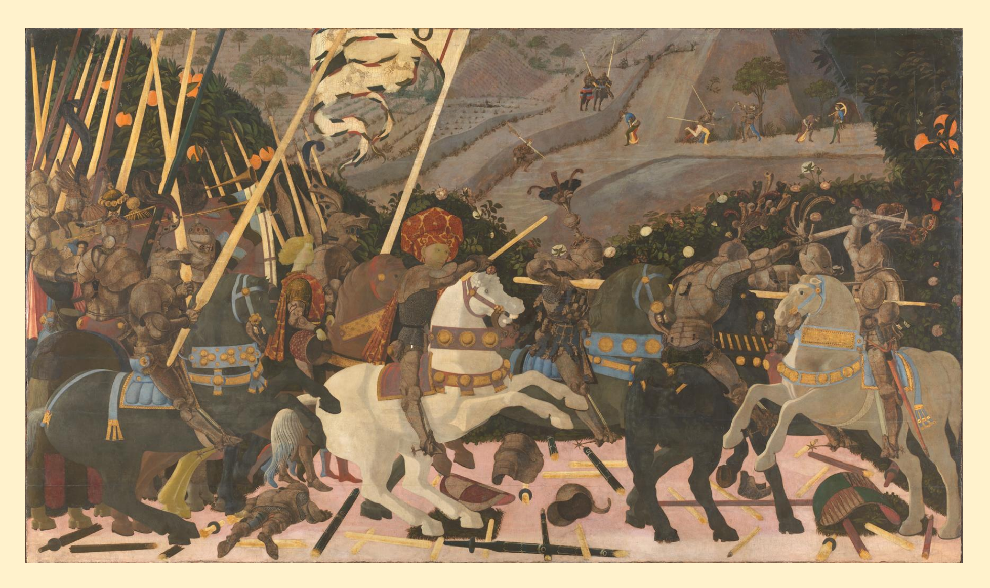
Paolo Uccello, Niccolò Mauruzi da Tolentino at the Battle of San Romano, c. 1438-40, Rm 59 The National Gallery, London