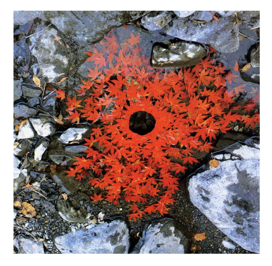
Could you create a pattern from nature?