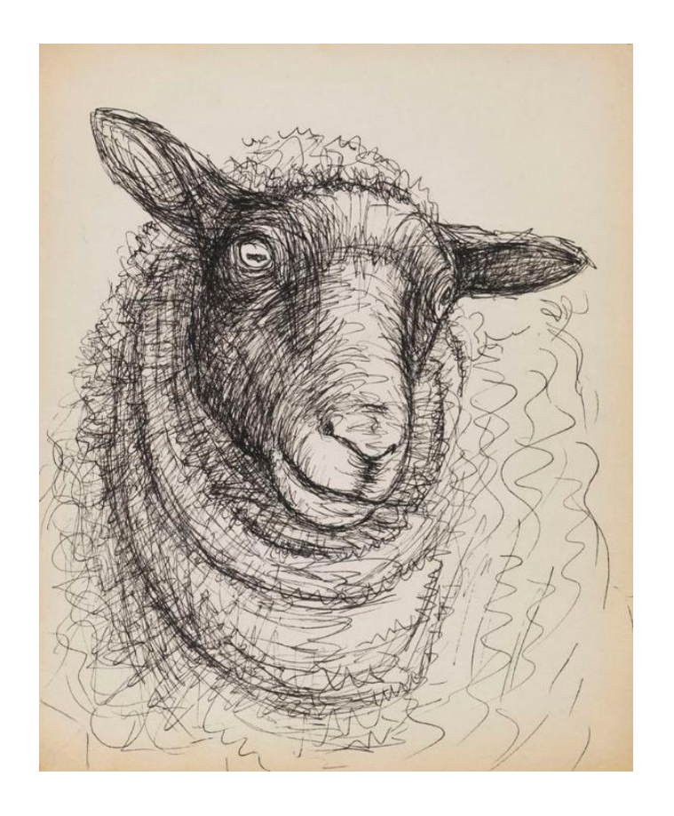
Could you make some ink drawings of animals or trees?