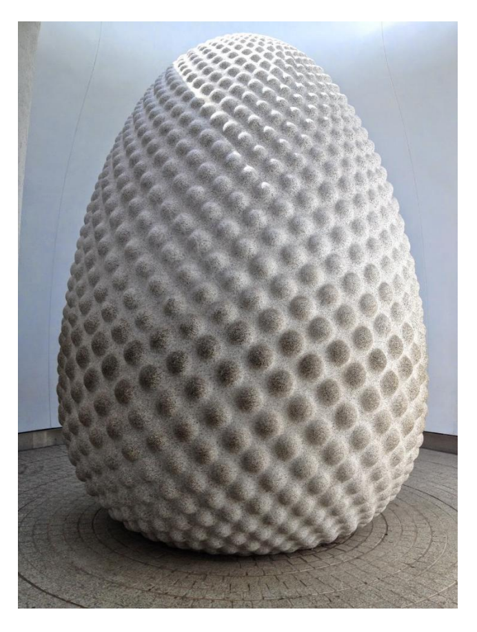
Could you make a clay model?