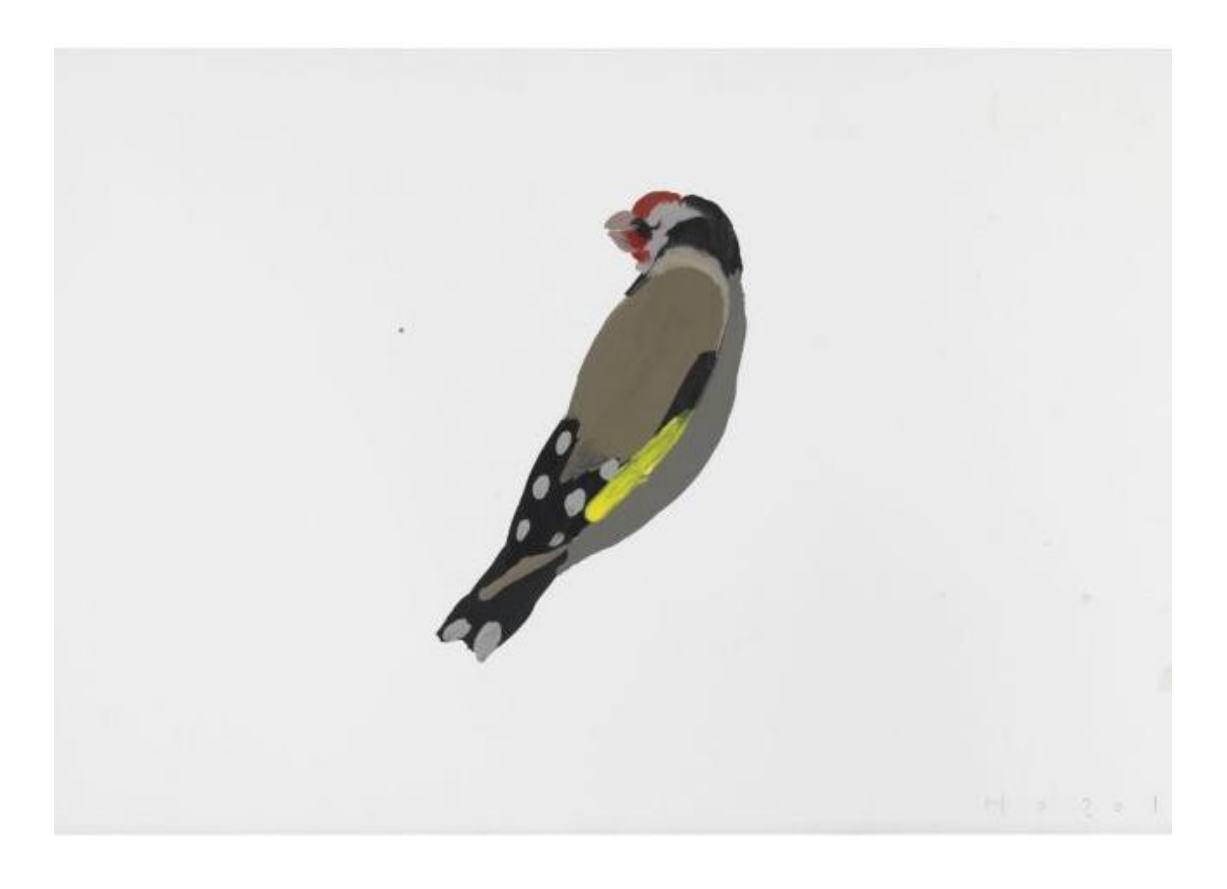
Could you paint some birds?