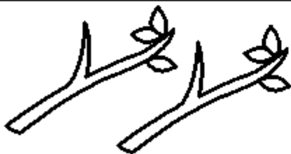
2 or 3 small lengths of wood (e.g. dowel rods or strong twigs)