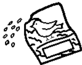
bird seed or nuts (optional, can be added later)