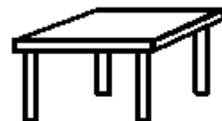
Working space (e.g. table in the garden)