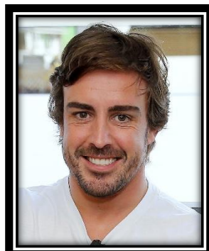
Ferdinand Alonso in 2016

Finish your work by adding some pictures or illustrations. You can copy and paste these from the internet or you can draw your own. Don't forget to write a caption for each picture - a sort sentence to explain what the picture shows.